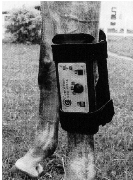
Centurion Mini Pulse System